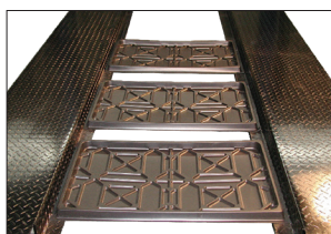
FOUR (4) DRIP TRAYS