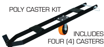
INCLUDES FOUR (4) CASTERS